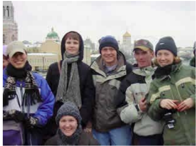
Russian and American Students touring Moscow