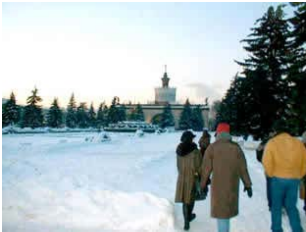
Walking in the cool evening air at the Exhibition